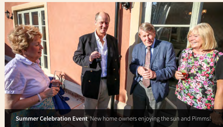
Summer Celebration Event New home owners enjoying the sun and Pimms!

The beautifully designed 4 and 5 bedroom detached houses are built to the highest quality and specification, with distinctive features such as balconies, wrap around verandas and attractive gable designs whilst internally the use of English oak and immaculate finishes make these a really exceptional buy.