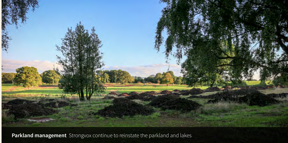
Parkland management Strongvox continue to reinstate the parkland and lakes

Sandhill Park is steeped in history. Built around 1720 the manor house was used in the 20th century as a prisoner of war camp, a home for handicapped children and later as a military and civilian hospital. Following years of decay and a serious fire in 2011 it was placed on the Heritage Risk Register before being 'rescued' in 2013 by Strongvox Homes. Strongvox worked with English Heritage and the Council's planning team to achieve planning consent for a sympathetic development of new houses to be built in the grounds secured the future of the mansion house. The good news is that restoration of the mansion is now underway by Devington Homes and the surrounding parkland is being reinstated by Strongvox including dredging and re-establishing the original lakes and recreating the formal American gardens.