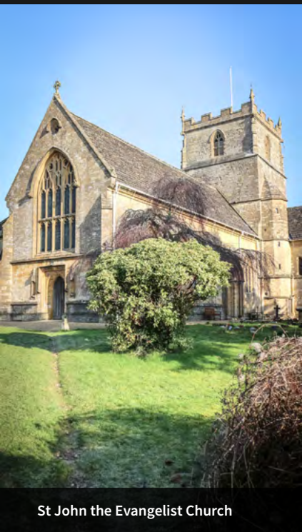
St John the Evangelist Church