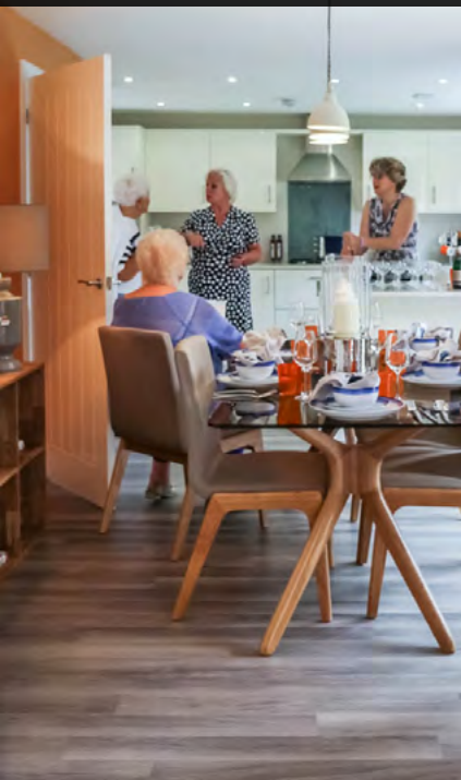
Preview Local residents enjoyed the day