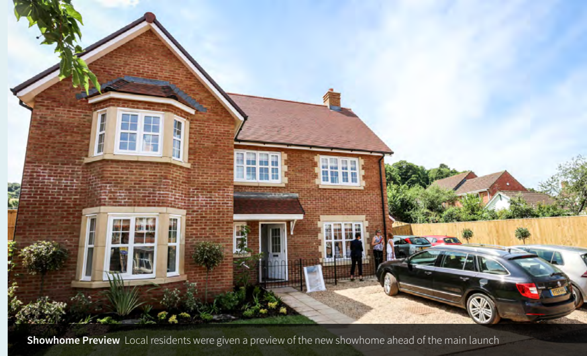
Showhome Preview Local residents were given a preview of the new showhome ahead of the main launch

Sales have also got off to a flying start at Ellicombe Gardens in Minehead, situated at the western end of the famous West Somerset Steam Railway.